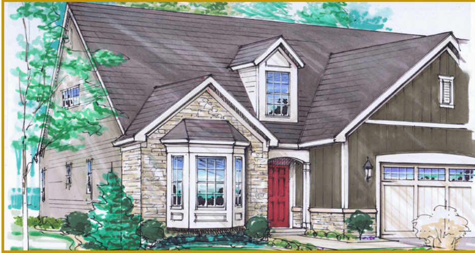
Optional bay window elevation rendering shown here